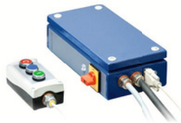
MAGNOS control unit KEH-EC 04

The control unit KSS-EC 01 can be used to control a magnetic chuck. The magnetic chucks only require a short pulse for clamping and releasing. This is achieved via simple actuation via a hand-held remote control.