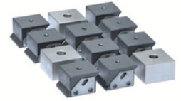
Pole extension for any workpiece geometry

MAGNOS square pole technology is the ideal clamping solution for powerful cutting processes. It can be used with any system and offers energy-efficient, process-capable clamping for all common milling, grinding, and machining centers.