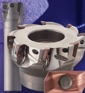
90° Shoulder Milling Series