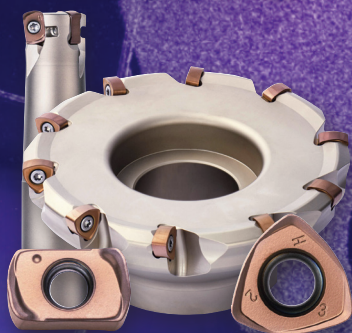
High-Feed Milling Series